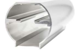
Euro Header (2,6,7,8)