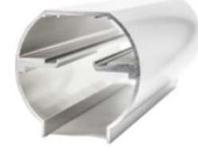
Euro Header (2,6,7,8)