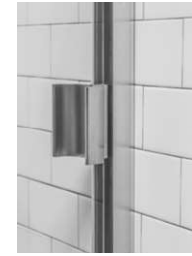
Handle / Full Height Magnetic Latch (2,6,7,8)