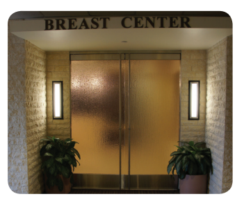
TVS Commercial Entrance custom cast glass design Harris Methodist Hospital Southwest Fort Worth Fort Worth, TX Glazing Contractor: Hill Country Glass