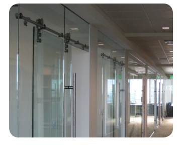
TVS Sliding Interior Door System Private Law Firm Seattle, WA Glazing Contractor: Eastside Glass