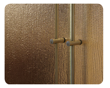
Hartung stocks an extensive selection of door hardware and decorative glass options to suit nearly any application