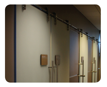
TVS Sliding Interior Door System Backpainted with floor-lock hardware Private Health Care Office Fort Worth, TX Glazing Contractor: Universal Glass Company