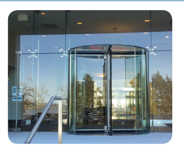
TVS Entrance and Structural Wall Watergate Towers: Emeryville, CA Glazing Contractor: Pinnacle Installations