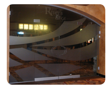
TVS Entrance River's Edge Casino Redding, CA