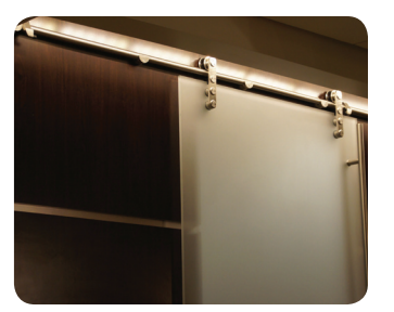
TVS Sliding Interior Door System Backpainted with floor-lock hardware Private Health Care Office Fort Worth, TX Glazing Contractor: Universal Glass Company

3/8" to 1/2" tempered safety glass + Patch and pivot swing doors + Modern hardware from industry leaders + Each system is custom manufactured