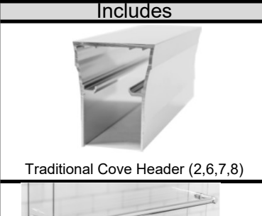
Traditional Tubular Touris Day (A.C.)