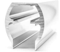
Heavy Duty Euro Header (2,6,7,8)