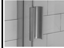
Low Profile Handle (2,6,7,8) / Full Height Framed Magnetic Latch