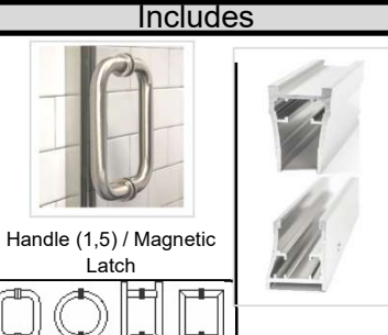
D-Pull C-Pull Ladder Miter Choice of 6" Handles (1,5) Header/ Curb System (2,6,7,8)