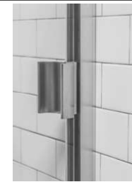
Handle / Full Height Magnetic Latch (2,6,7,8)